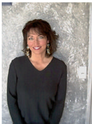
to cut off. Photo of the new me!

Don't be too shocked when you see me for your next follow up! After years of highlighting my hair, I let it all grow out to see what color it was going to be—blah, was the answer. So I grew out the last of the highlights till it was long enough